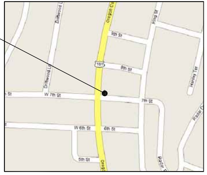
VICINITY PLAN SCALE: NTS

PROJECT LOCATION NORTHEAST CORNER HWY 101, N., & E. 7th ST. YACHTS, OREGON