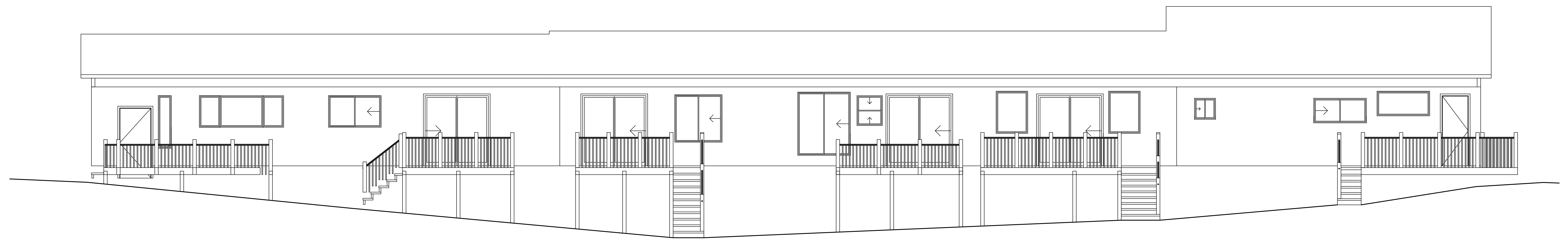
A WEST ELEVATION SCALE: 1/4" = 1'-0"